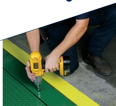
SafeTFrame® Construction, ensuring level transition from warehouse floor to dock leveller